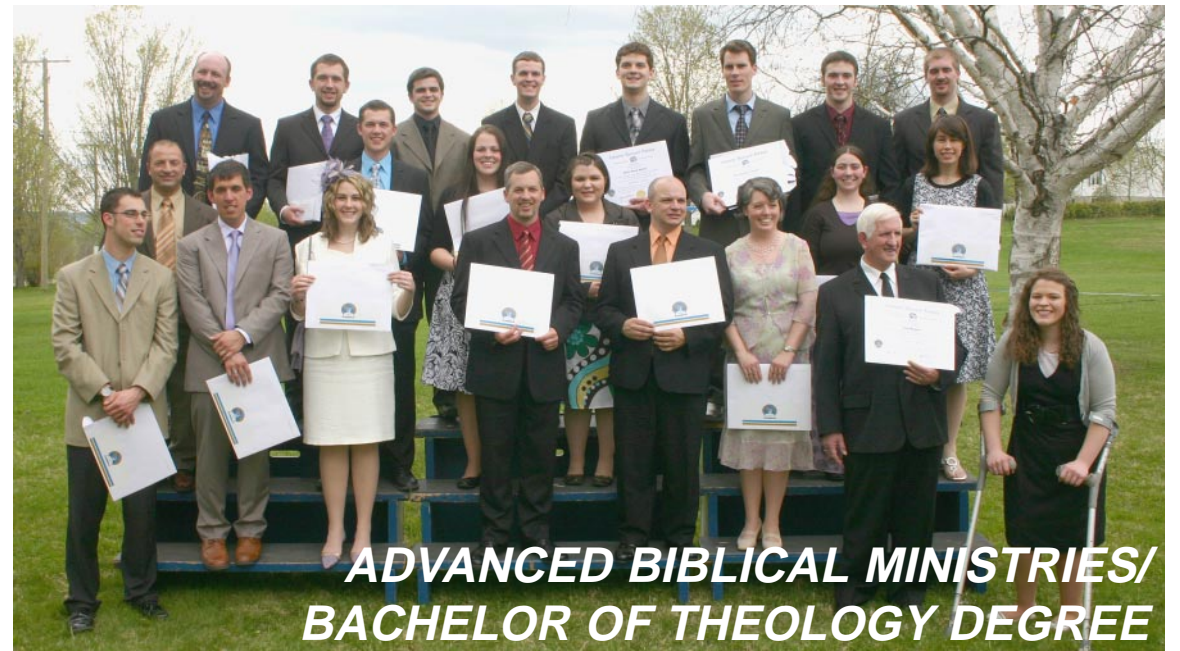
ADVANCED BIBLICAL MINISTRIES/ BACHELOR OF THEOLOGY DEGREE