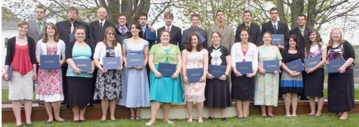
ASSOCIATE DIPLOMA OF BIBLICAL AND THEOLOGICAL STUDIES