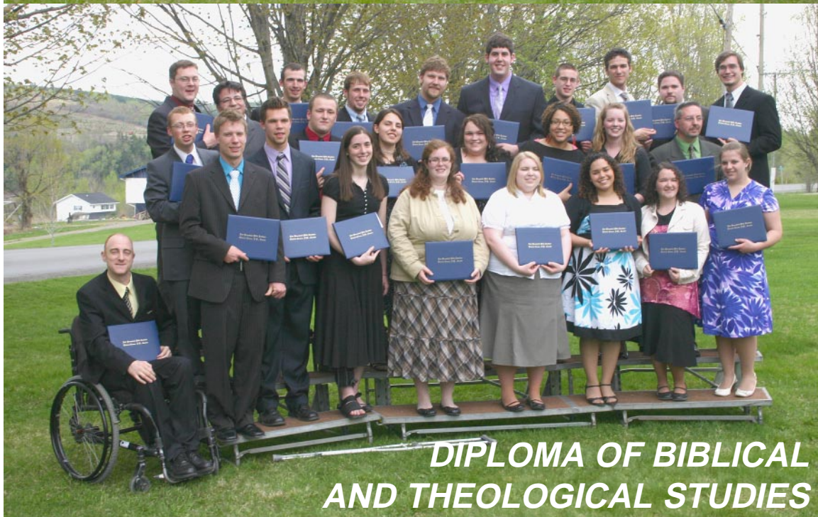
DIPLOMA OF BIBLICAL AND THEOLOGICAL STUDIES