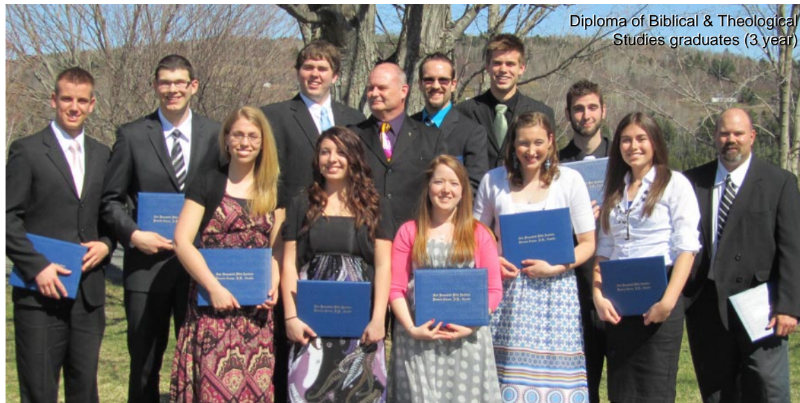
Diploma of Biblical & Theological Studies graduates (3 year)