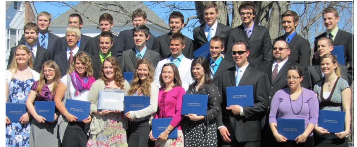
Above: Associate Diploma of Biblical & Theological Studies graduates (1 year)