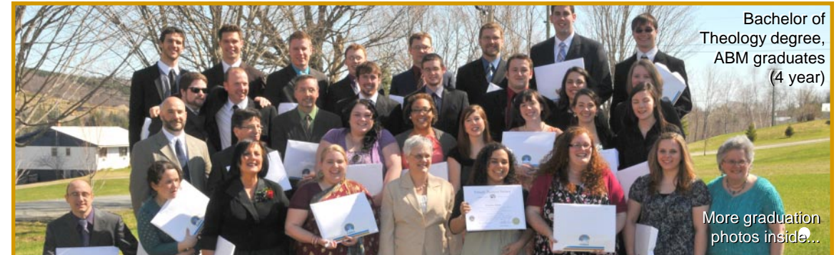
Bachelor of Theology degree, ABM graduates (4 year)