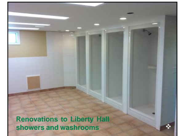
Renovations to Liberty Hall showers and washrooms ❖