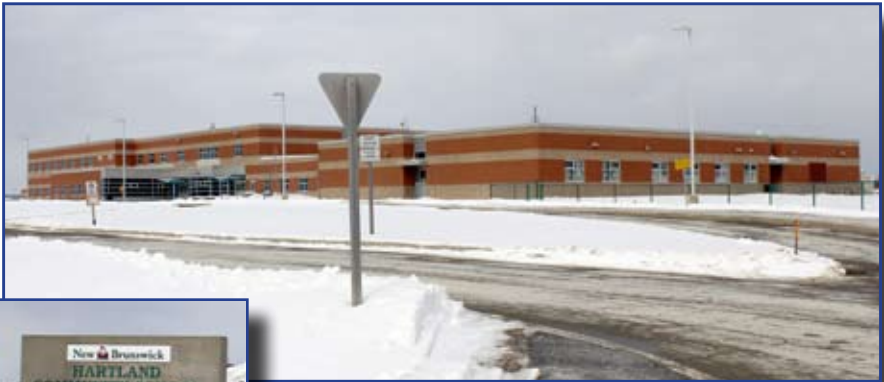
Hartland Community School, Kindergarten - Grade 12