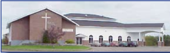
Somerville Christian Academy, Kindergarten - Grade 6

Children of students and staff attend our local schools. At the present time there is a good Christian School associated with the People's Church just 2.6 kilometres from NBBI with classes for kindergarten to grade six. Hartland Community School includes Kindergarten to Grade 12 and is located 5.9 kilometres from NBBI. School busses pick children up and drop them off right in front of our campus for those living here.