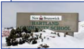
Hartland Community School, Kindergarten - Grade 12