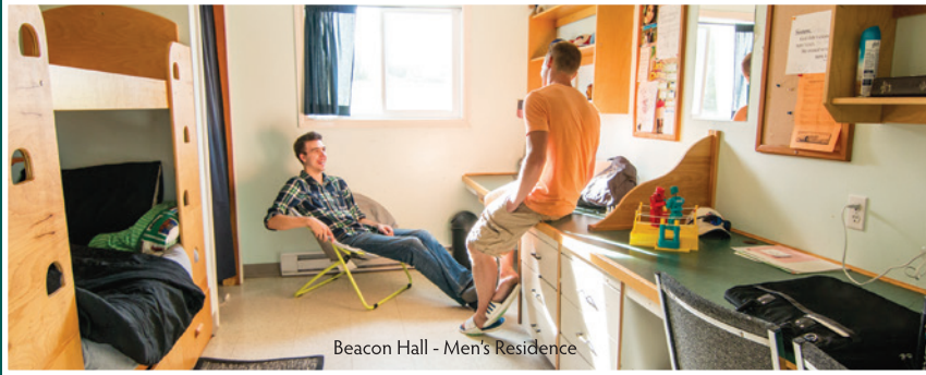
Beacon Hall - Men's Residence