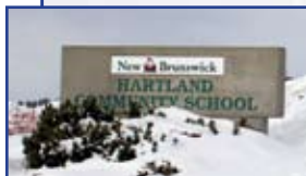
Hartland Community School, Kindergarten - Grade 12